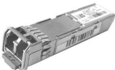
Figure 1. Cisco Optical Gigabit Ethernet SFP

The industry-standard Cisco® Small Form-Factor Pluggable (SFP) Gigabit Interface Converter (Figure 1) links your switches and routers to the network. The hot-swappable input/output device plugs into a Gigabit Ethernet port or slot. Optical and copper models can be used on a wide variety of Cisco products and intermixed in combinations of 1000BASE-T, 1000BASE-SX, 1000BASE-LX/LH, 1000BASE-EX, 1000BASE-ZX, or 1000BASE-BX10-D/U on a port-by-port basis.