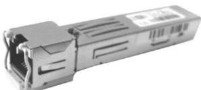
Figure 2. Cisco 1000BASE-T Copper SFP